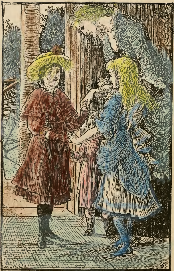
"BEATA, DEAR, THIS IS MY ROSY," SHE SAID.—Page 34.